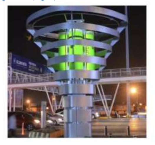
Figure 1(left): Robotic trees in Mexico Figure 2(right): Parasitic Drones in Hong Kong

Source: Figure 1 (left) Goodson, 2019; Figure 2 (right) MacDonald, 2014 Technological innovations of the 4IR aiming to reduce carbon emissions include robotic trees, parasitic drones, air-cleaning buses and air separation plants. The robotic trees, as seen in Figure 1, have been placed in Mexico. Each tree contains microalgae that absorb carbon dioxide and produce oxygen. Meanwhile, the use of carbonsucking polymer in parasitic drones has been explored in Hong Kong, as seen in Figure 2. Aircleaning buses, as seen in Figure 3, were invented