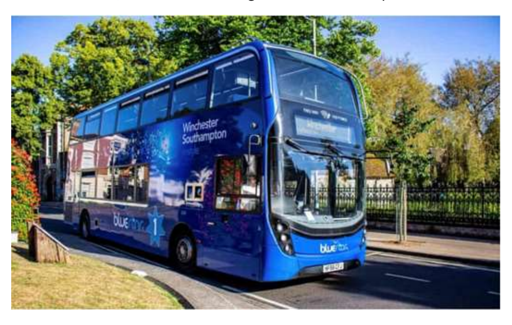
Figure 3. Air-cleaning Bus in the UK (Taylor, 2018)

In comparison with other regions in the world, the Asia-Pacific is more vulnerable to climate change risks due to its dependence on agriculture and natural resources, heavy populated coastal areas, frail institutions and relatively high poverty levels (ADB, 2012). A 2020 Deloitte global report reveals that 81 per cent of Australia's business leaders believe that their business operations will be negatively impacted by climate change. The number is much higher than the global average of 48 per cent. Australia's business leaders assume that the 4IR technology with the greatest impact for investment is Artificial Intelligence (AI) followed by nanotech (Deloitte, 2020). In China, the Government introduced the country's version of Industry 4.0, "Made in China 2025", in 2015 as one of its efforts to lower carbon dioxide emission intensity per unit of GDP by 60 per cent to 65 per cent of the 2005 levels by 2030. It aims to ensure innovation-driven and green manufacturing in China (UNIDO, 2016).